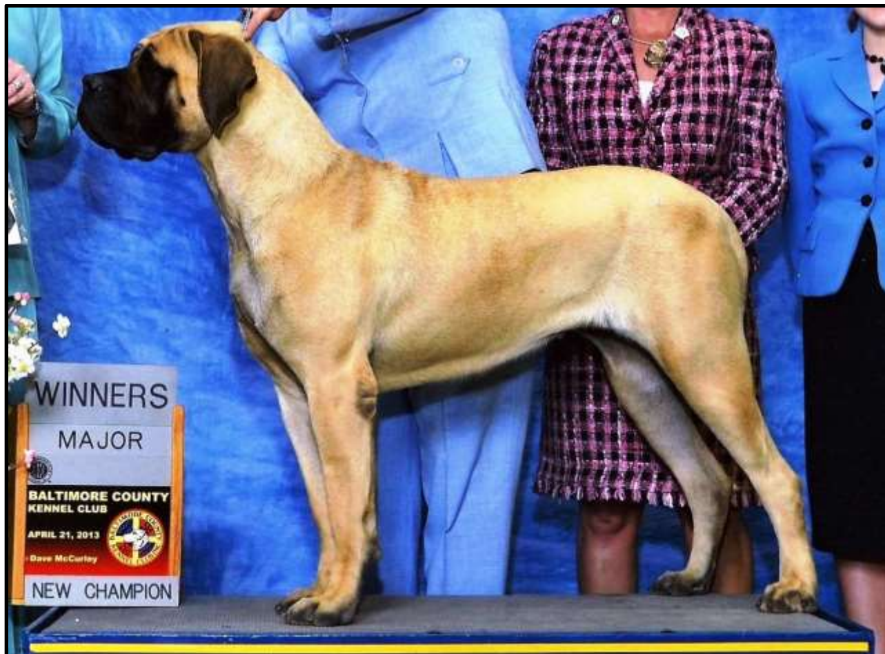
Championed at 15 Months